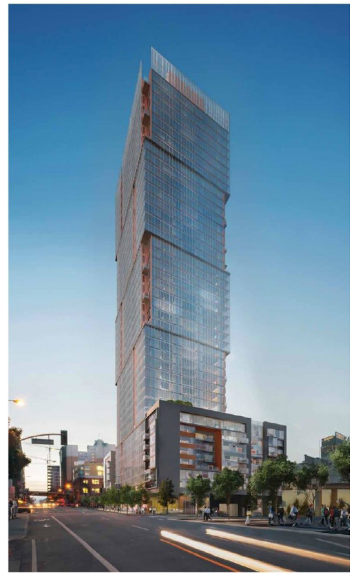
EssexProperty Trust intends to build a 42-story residential building on Transby Block 9, as pictured in this project rendering.

In the hands of Essex Property Trust, Transbay Block 9 will become a 42-story residential building with approximately 545 units, of which 109 will be below market rate. The project will also include ground floor retail and at least 2,400 square feet of public open space. A groundbreaking date for the new residential building has not yet been determined.