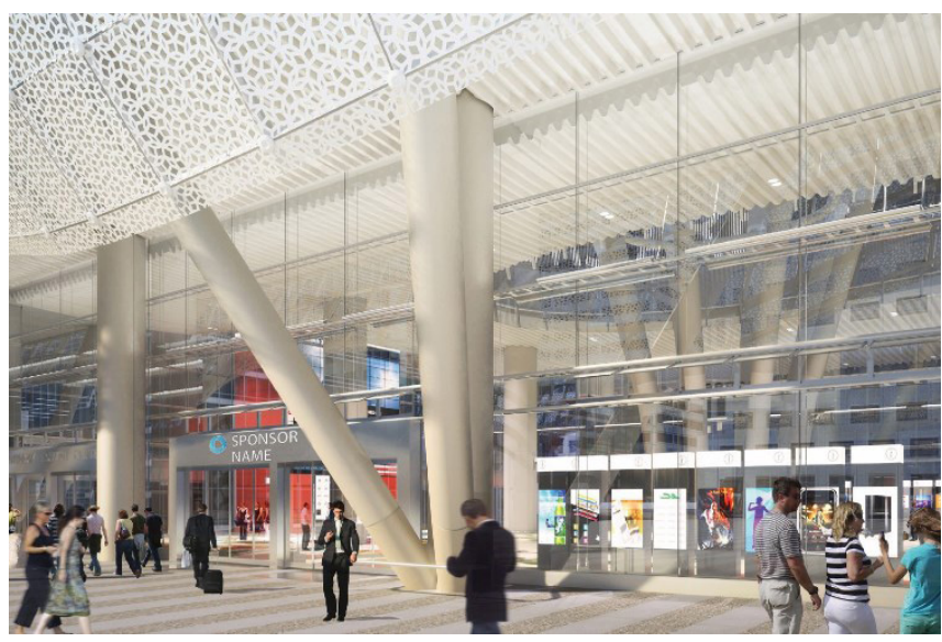
Sponsors of the Transbay Transit Center will have unparalleled opportunities to reach millions of transit riders, workers, residents and tourists in the new heart of downtown San Francisco.

Interested parties can access the RFP by visiting <a href="www.">www.</a> <a href="www.">www.</a> <a href="www.">TransbayCenter.org</a>, and navigating to "Current Contract Opportunities" under the "TJPA: Doing business with the TJPA" tab.