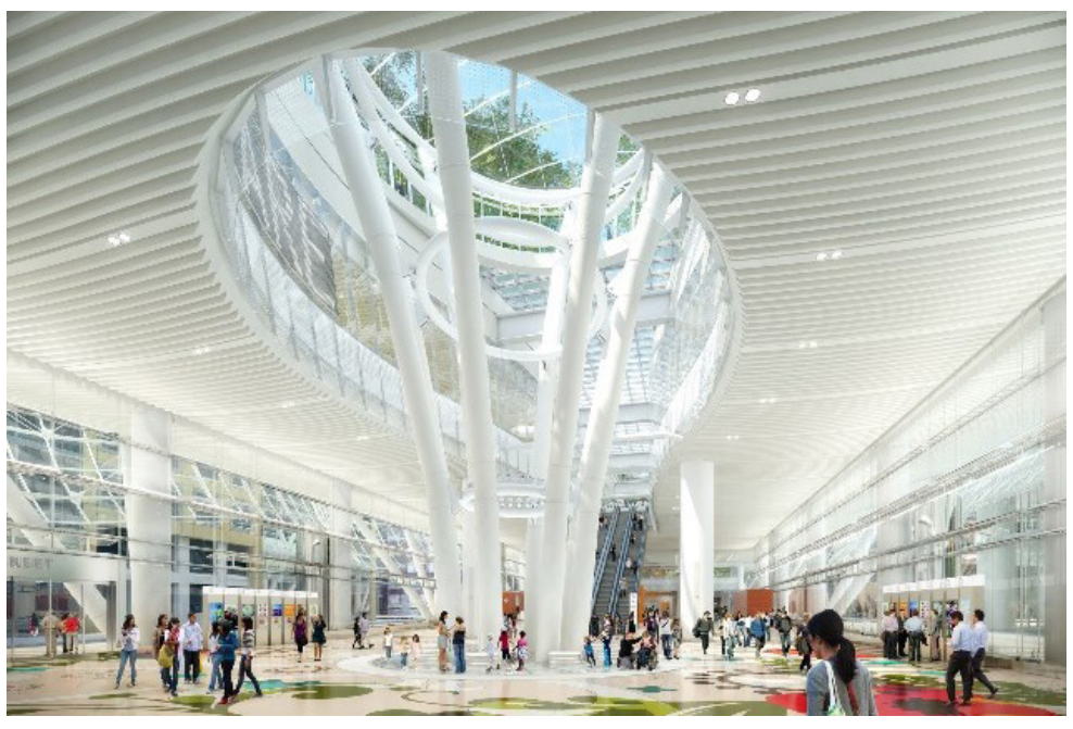
Light columns bring in natural light to reduce energy usage during daylight hours.

By providing passive heating and cooling, the geothermal system eliminates the need to run as many boilers as a traditional building, reducing the Transit Center's consumption of natural gas, saving energy and ultimately reducing greenhouse gas emissions. Together these systems reduce the Transit Center's energy use by 28 percent over a similar conventional building. The resulting emissions reductions are on top of the reductions from the elimination of 260,000 vehicle miles per day that will occur when the Downtown Rail Extension is complete.