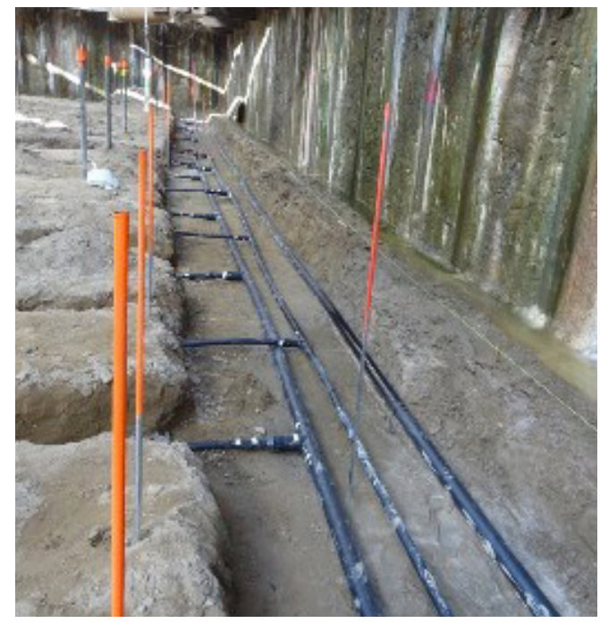
Geothermal piping under the foundation of the Transit Center will reduce heating and cooling needs for the Transit Center, helping to achieve a LEED Gold rating.